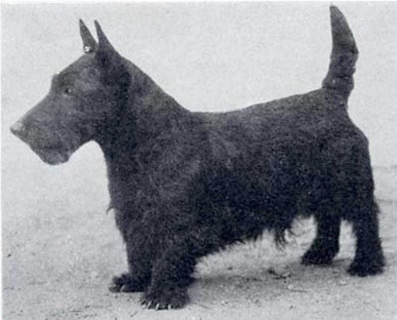
Champion Lochtay Invader