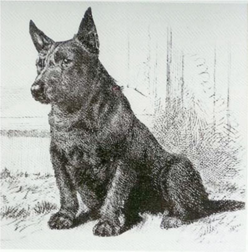
Eng. Ch. Dundee, one of the two founding sires of the breed.