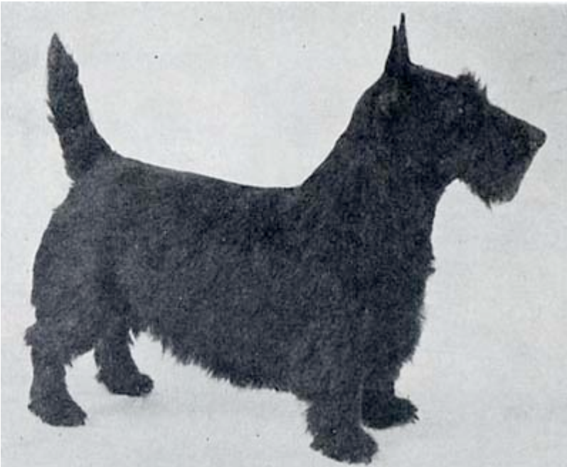
Champion Bentley Cotsol Lassie

The first revision to the American Standard, written in 1925, set the height at "about ten inches at the shoulder." Back length was still described as "moderately short," but the comparative reference to the Skye Terrier was deleted. When the 1925 standard was published in the AKC Gazette, the article was illustrated with pictures of the top-winning Scottish Terriers of the day. Furthermore, the words used to describe these dogs include "compact," "cobby," and "correct body type." The 1925 standard made some other significant changes, including the elimination of hazel eyes and half-prick ears.