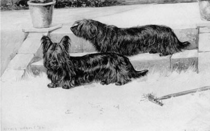
Body – Pre-eminently long and low... STANDARD OF POINTS OF THE SKYE TERRIER CLUB (SCOTLAND) as printed in W.D. Drury’s “British Dogs,” 1903

It is important to consider the meaning of “of moderate length,” since the issue of Scottish Terrier body length continues to be somewhat controversial. Below are three illustrations of 19 th century terriers accompanied by the language of their respective breed standards regarding body length: