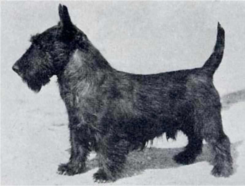
Champion Fairwold Ornsay Bill