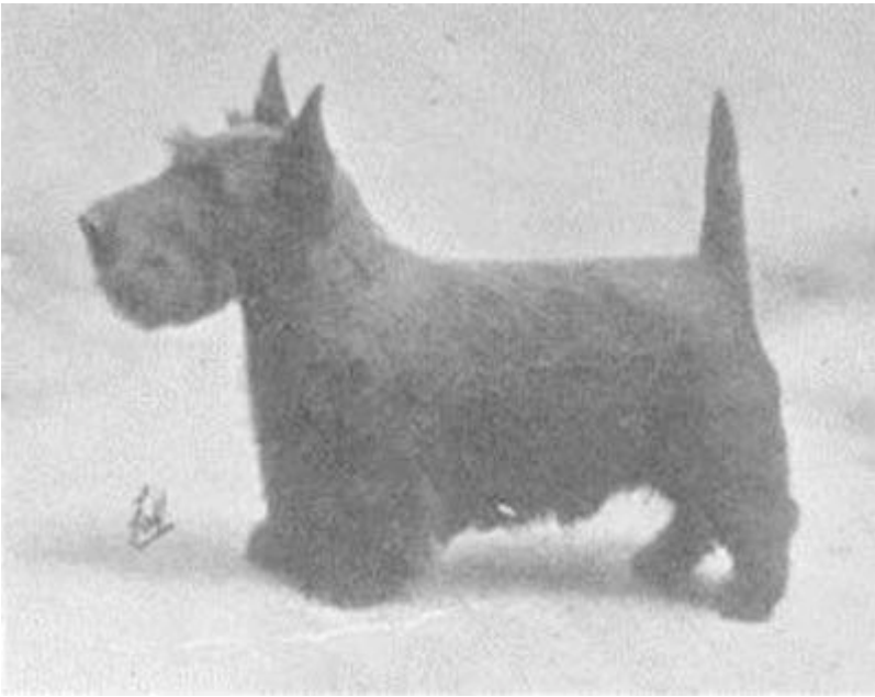
Eng. Ch. Heather Necessity